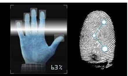
1-rasm.Barmoq izini scanerlash.

Bu tizim biometrik autentifikatsiya qilishda "Daktiloskopik" usuli deb aytiladi.