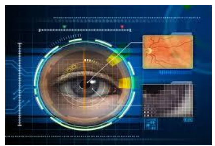
5-rasm.Ko`z to`r pardasi yordamida autentifikatsiyalash.

Ko`z yoyi yordamida autentifktasiya qilishda ancha murakkab va sezilarli darajada vaqtni olishi qon tomirlar bilan ishlash vaqtida ko`zning yumilish holatlari autentifikatsiyalash jarayonida bir qancha muammolar keltirib chiqaradi.