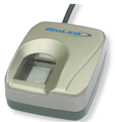
2-rasm.Barmoq izini skanerlash apparat qurilmasi.

Barmoq izlarining skanerlari. Barmoq izlarini skanerlovchi an`anaviy qurilmalarda asosiy element sifatida barmoqning xarakterli rasmini yozuvchi kichkina optik kamera ishlatiladi.