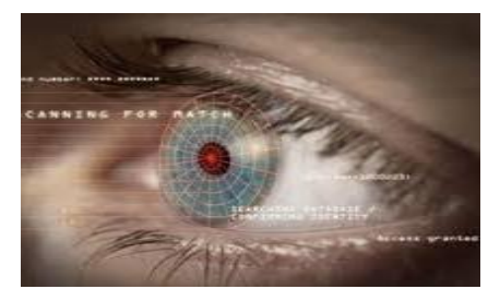
4-rasm.Ko`z yoyi yordamida autentifikatsiyalash.

uning joylashgan o`rni o`lchamlari olingan holda autentifikatsiya qilish usuli ko`rsatilgan.